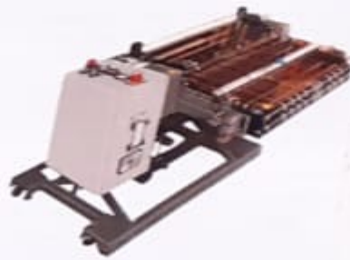
Solomachine ohne Auslegesystem

Eisenpresse für Kleinformat Type - BAS 450 - KF8